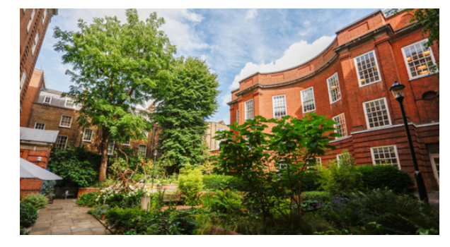
Garden Ground Floor Capacities