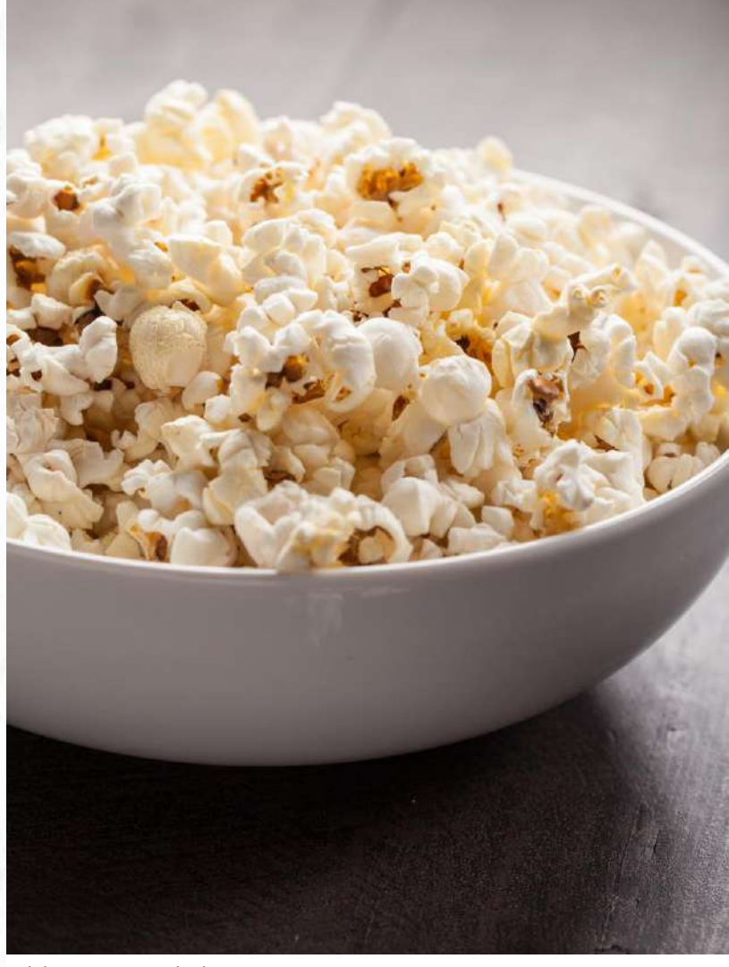
(V) - Vegetarian, (VG) - Vegan

Anything finishing past 18:00 is subject to FULL evening hire rates and a minimum spend.