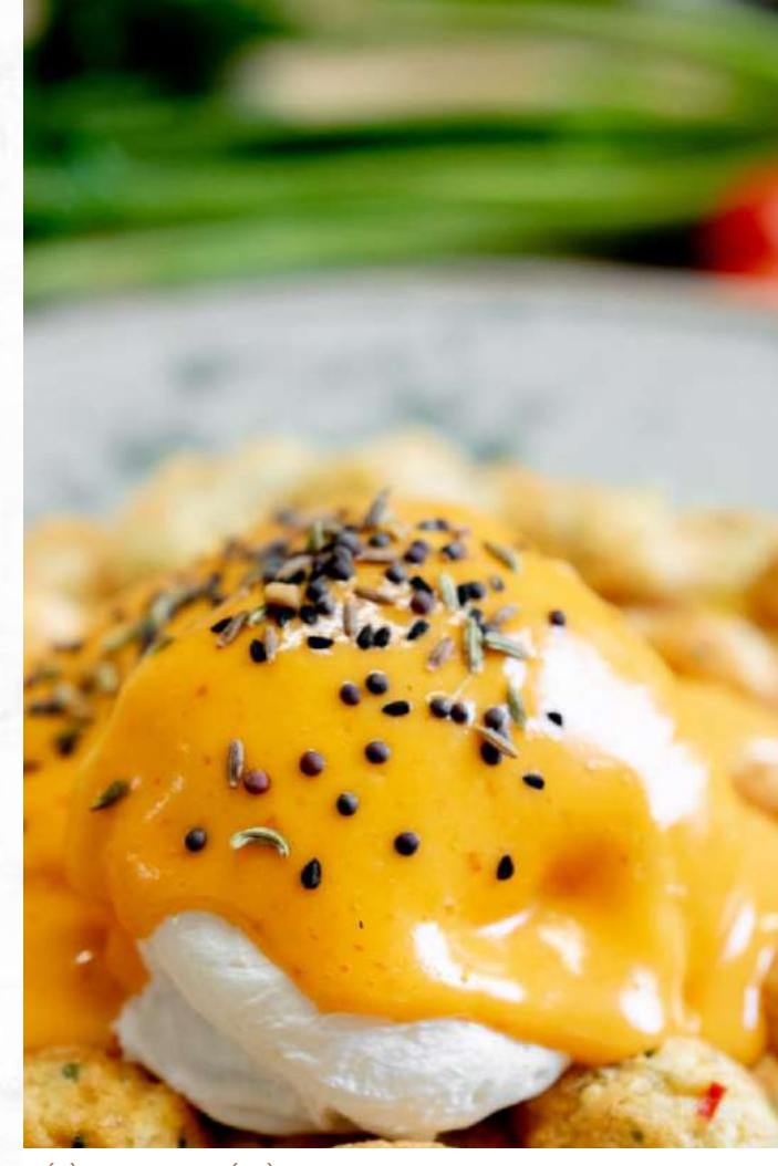
(V) – Vegetarian, (VG) – Vegan For those with special dietary requirements or allergies who wish to know about the food & drink ingredients used, please ask the Event Coordinator.

Full English standing breakfast buffet 828 kcal Additional charges for seated buffet would apply