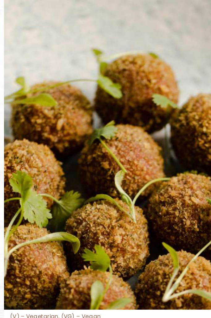
(V) – Vegetarian, (VG) – Vegan For those with special dietary requirements or allergies who wish to know about the food & drink ingredients used, please ask the Event Coordinator.

Recommended wine pairing: Tunante Rioja Tempranillo Tinto, Fincas de Azabache