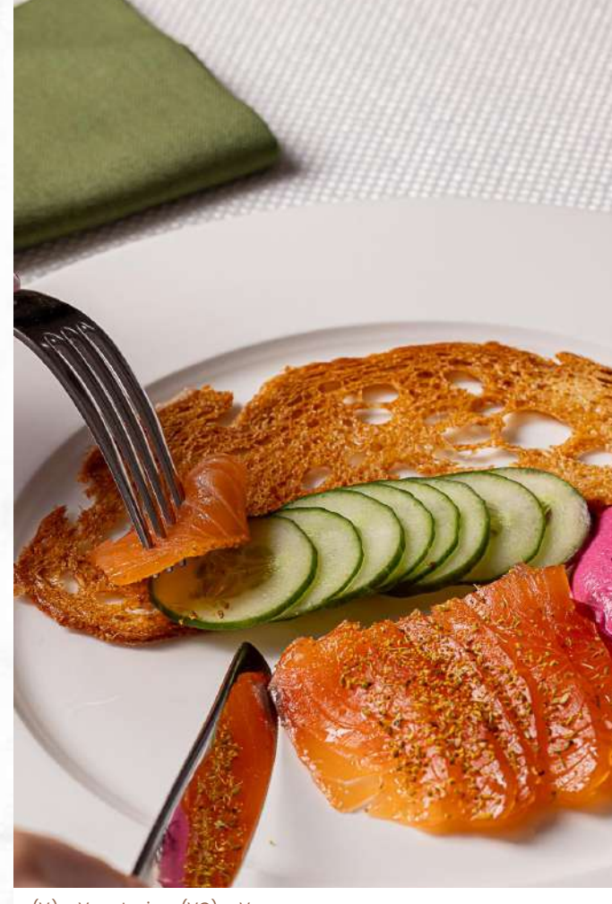
(V) – Vegetarian, (VG) – Vegan For those with special dietary requirements or allergies who wish to know about the food & drink ingredients used, please ask the Event Coordinator.

Free range chicken, pumpkin seeds, orange blossom, radish 390 kcal