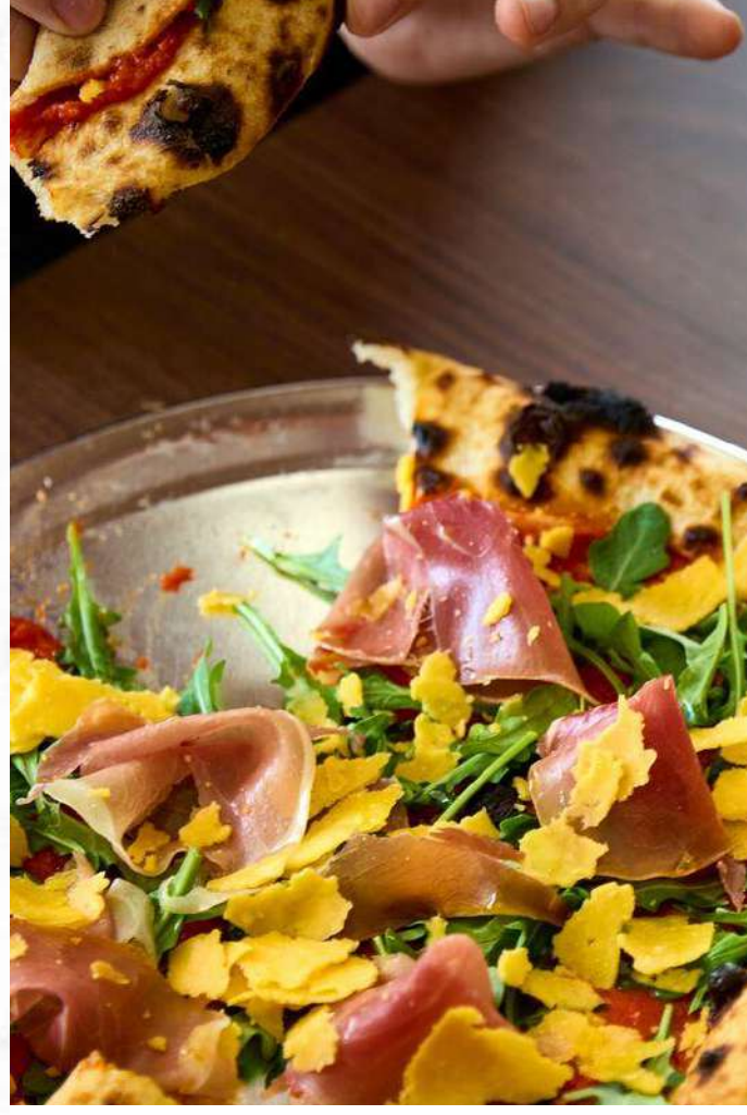
(V) – Vegetarian, (VG) – Vegan For those with special dietary requirements or allergies who wish to know about the food & drink ingredients used, please ask the Event Coordina tor.

Roasted vegetable pizza – Romano peppers, courgette, 'apple wood cheddar' and basil (VG) Margherita pizza – Rich tomato sauce, fior di latte cheese, oregano (V) Cobble lane special – Cobble Lane nduja, fennel salami, mature cheddar, rocket Mushroom pizza – seasonal woodland mushrooms with Berkswell cheese (V) Add extra toppings £2.00 Recommended wine pairing: Montepulciano d'Abruzzo Riserva, 'Tor del Colle'