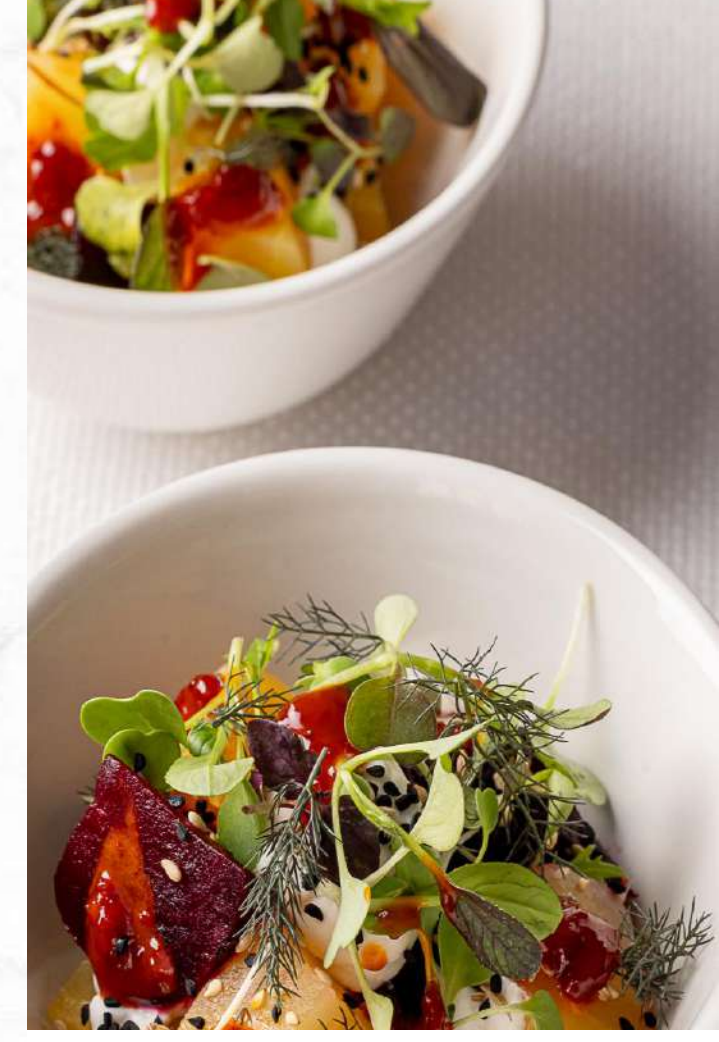
(V) – Vegetarian, (VG) – Vegan For those with special dietary requirements or allergies who wish to know about the food & drink ingredients used, please ask the Event Coordinator.

Strawberry Eton mess, lavender meringue (VG) 111 kcal Chocolate brownie, diplomat cream (V) 424 kcal Buttermilk panna cotta, mango, strawberries (V) 489 kcal Whipped London ricotta cheesecake, cookie crumble (V) 443 kcal