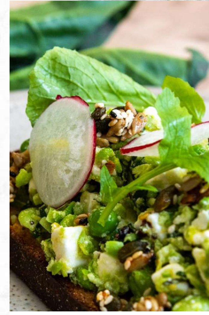
(V) – Vegetarian, (VG) – Vegan For those with special dietary requirements or allergies who wish to know about the food & drink ingredients used, please ask the Event Coordinator.

Additional items to add to your perfect breakfast can be found here