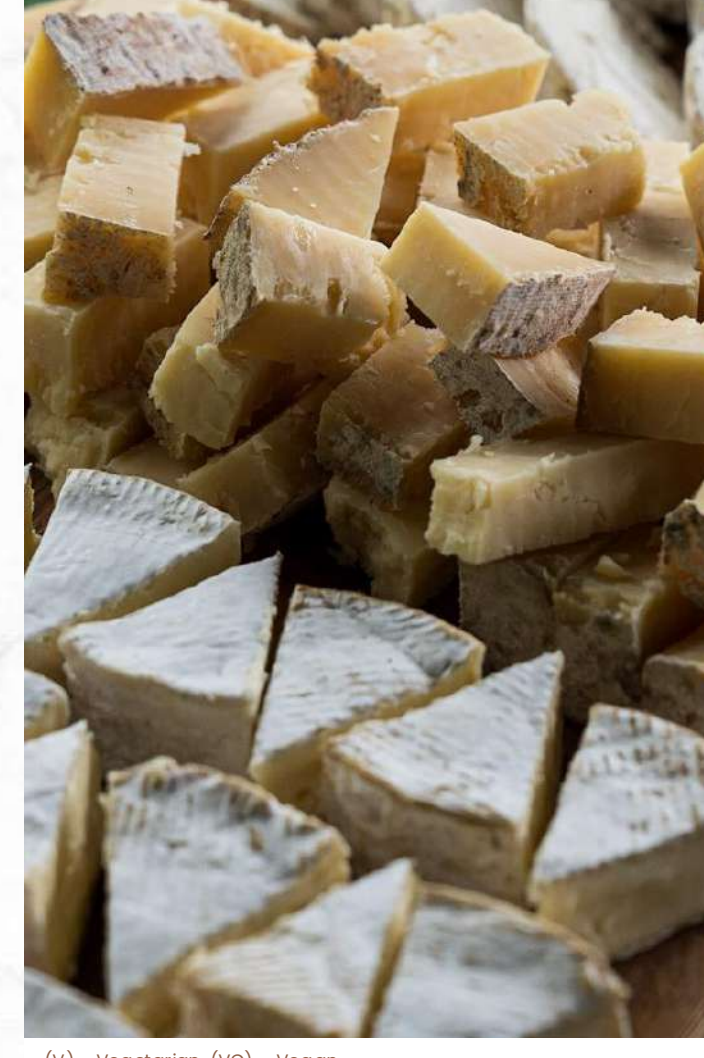
(V) – Vegetarian, (VG) – Vegan For those with special dietary requirements or allergies who wish to know about the food & drink ingredients used, please ask the Event Coordinator.

Fennel salami / Capocollo / Spicy nduja / Lomo pork loin / House pickles / Sourdough bread Recommended wine pairing: Punto Alto Malbec