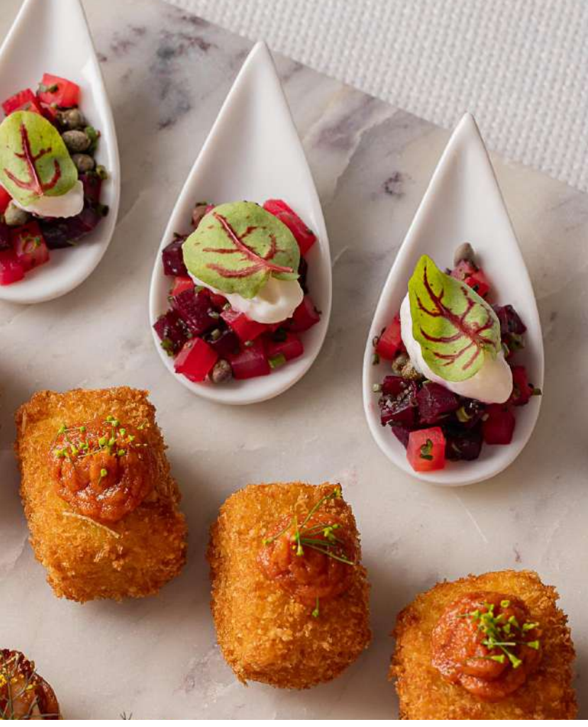
(V) – Vegetarian, (VG) – Vegan For those with special dietary requirements or allergies who wish to know about the food & drink ingredients used, please ask the Event Coordinator.

Thai cured salmon, lime & coriander mayo, tapioca cracker 74kcal Smoked trout mousse, rye bread, dill 71 kcal Citrus scallop cup, cucumber mayo, coriander 33 kcal Crayfish, cocktail sauce, smoked paprika 56 kcal