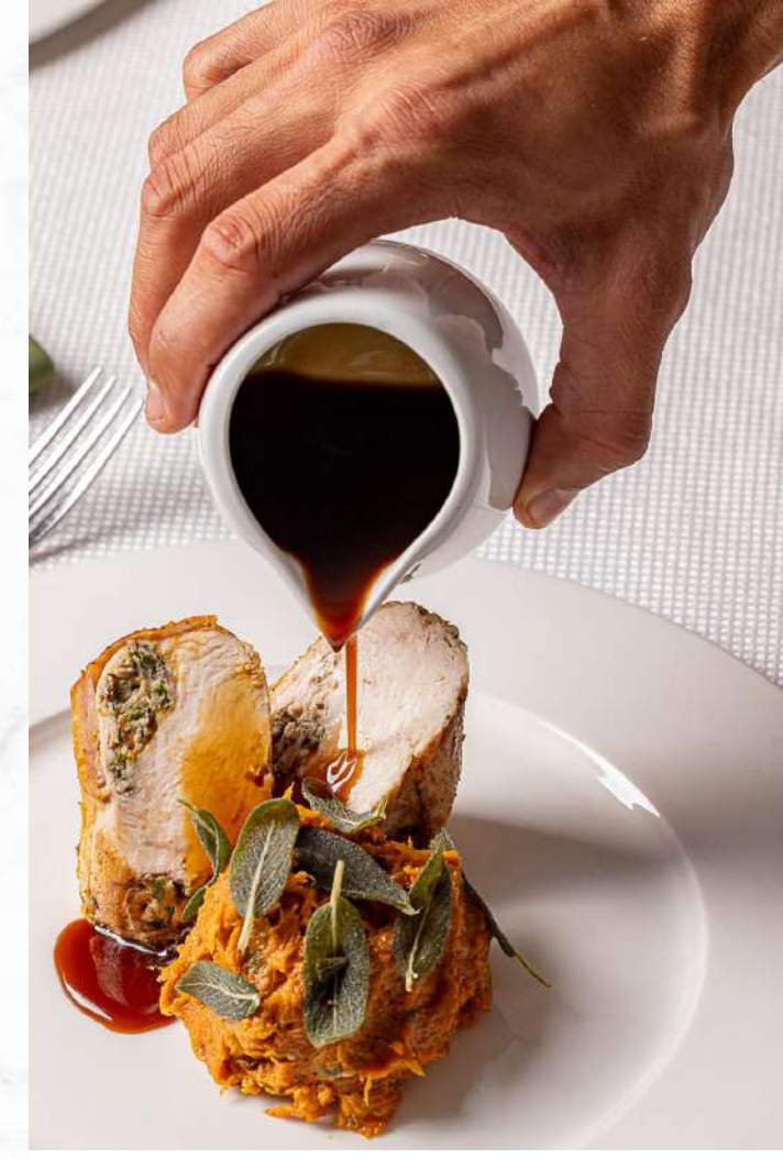
(V) – Vegetarian, (VG) – Vegan For those with special dietary requirements or allergies who wish to know about the food & drink ingredients used, please ask the Event Coordinator.

Cornish red chicken, artichoke purée, garden vegetables, seasonal mushrooms, potato terrine 1261 kcal